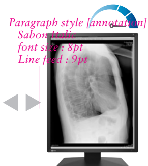
Instant Backlight Booster On

Paragraph style [annotation] Sabon LT Std Roman font size : 8pt Line feed : 9pt