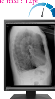
Instant Backlight Booster Off

Paragraph style [body] Sabon LT Std Roman font size : 8.5pt Line feed : 12pt